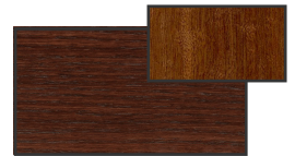
mahogany w/ sapelli inset